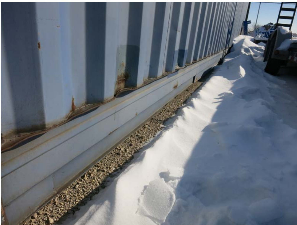
.1B Side Rail