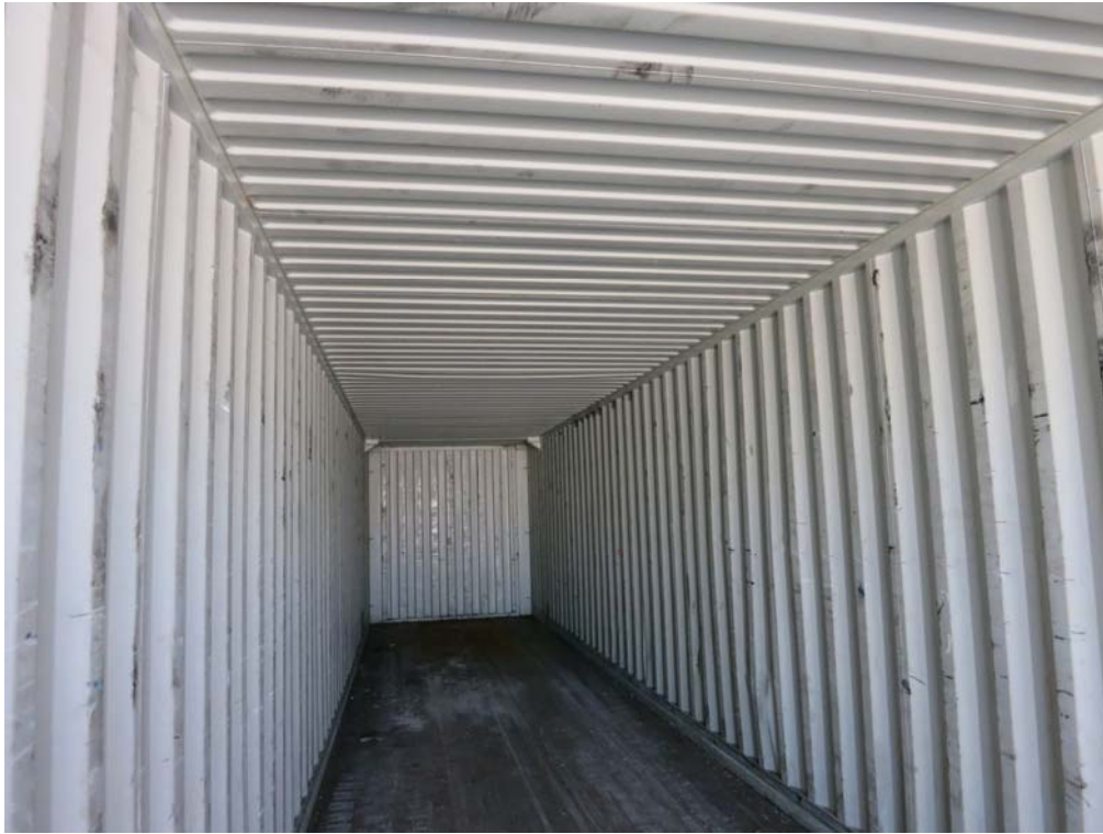
.1A Interior View