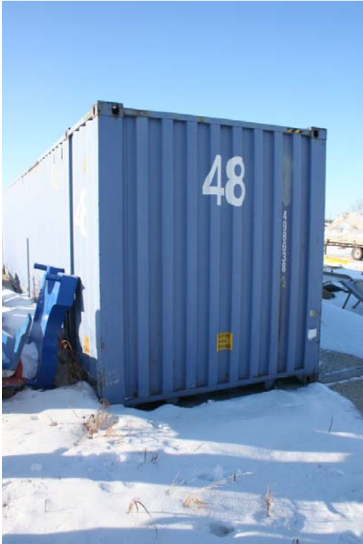
.1C Front View